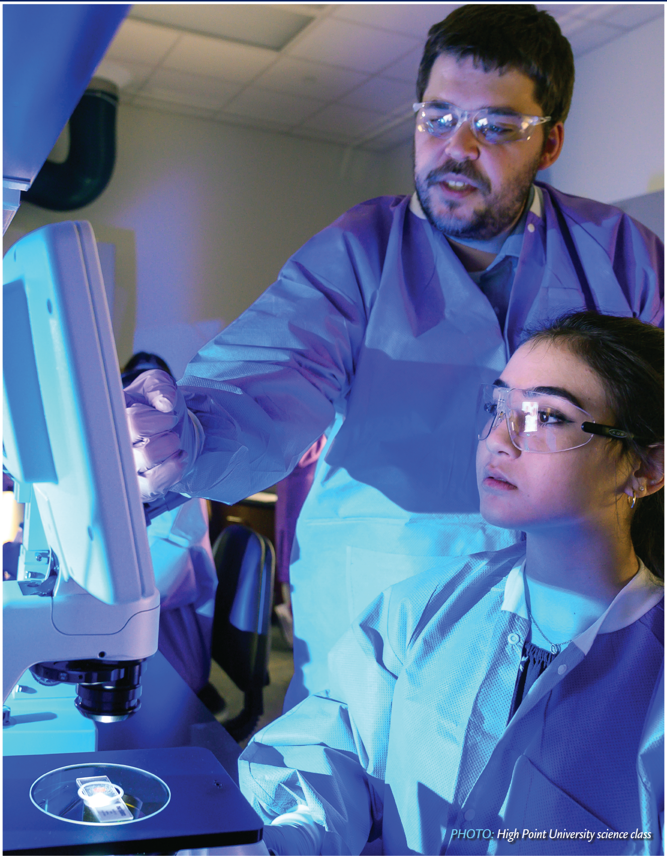
PHOTO: High Point University science class