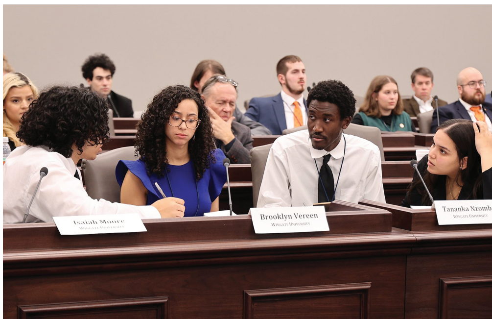
The Wingate University team confers during the final round of the 2023 NCICU Ethics Bowl.

A grant from the Office of State Budget and Management (OSBM) is funding development of a portal to connect to the State Longitudinal Data System (SLDS) . An RFP for the project has been completed, and work is expected to begin in late fall 2023. The goal of the system is to have better longitudinal education and workforce data available to enable education leaders and policymakers to make data-driven decisions about the achievement and needs for funding education.