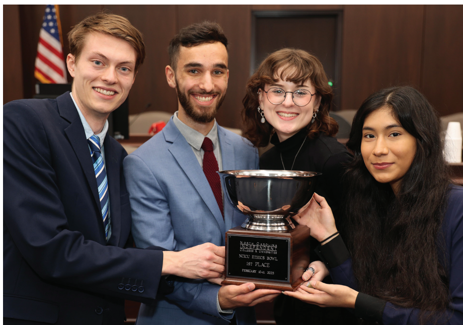
Queens University of Charlotte was named champion of the 12th Annual Ethics Bowl after facing Wingate University in the final round. Campbell University and Montreat College were also semifinalists.

NCICU completed a four-year Transfer Pathways grant provided by Teagle Foundation in partnership with the Council of Independent Colleges. The focus of the grant this year was on the development of advising videos for faculty and administrative advisors and of promotional materials to build awareness of articulation agreements.